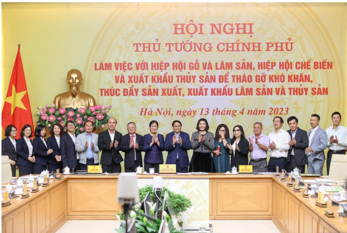
The Prime Minister took souvenir photos with delegates attending the conference