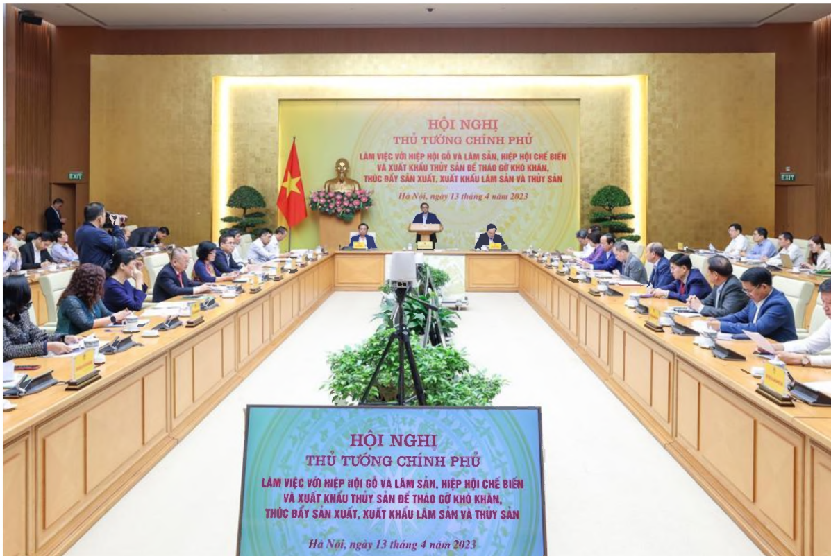
Panorama of the conference

The Prime Minister emphasized the goal of removing difficulties and obstacles, especially in markets, institutions, and credit capital for the production, processing and export of forest and fishery products to promote production and business. creating jobs and income for millions of workers in the field of forestry and fisheries.