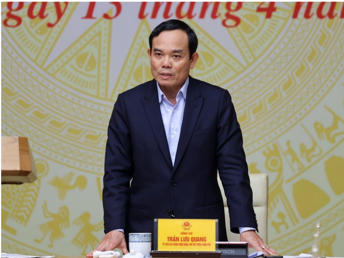
Deputy Prime Minister Tran Luu Quang spoke at the conference

In 2022, the agricultural industry has achieved spectacular growth, exceeding the set target; The wood and forest products manufacturing and processing industry continues to set a new record in export value reaching 17.1 billion USD, an increase of 7.1% compared to 2021, of which wood and wood products reached 16.1 billion USD. 01 billion USD, non-timber forest products reached 1.09 billion USD. Seafood export turnover in 2022 will reach 11 billion USD, up 23.8% over the same period in 2021 and up 22.2% compared to plan (9 billion USD), the highest ever.