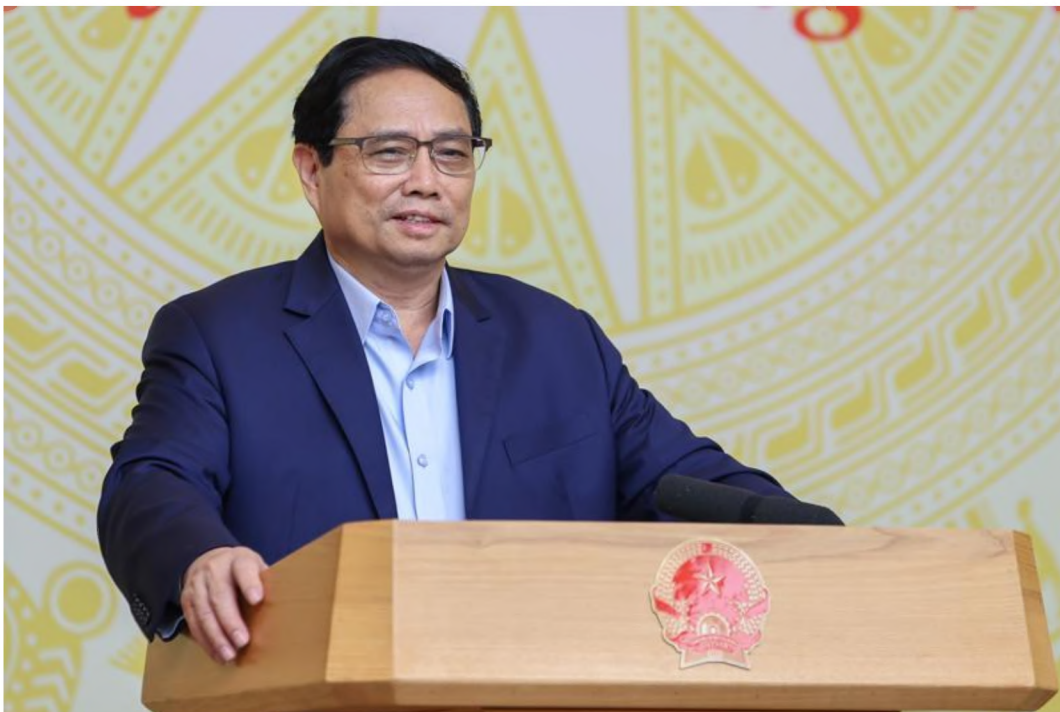
The Prime Minister spoke at the conference