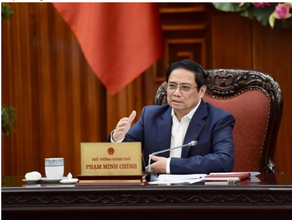
Prime Minister Pham Minh Chinh requested ministries, branches and localities to drastically implement solutions to remove difficulties and obstacles and promote production and export of forest and aquatic products.

(Chinhphu.vn) - The Prime Minister requests to urgently submit solutions for exemption, reduction, extension, postponement, extension of taxes, fees, charges, land and water surface rent; Research and propose a credit package of VND 10,000 billion to support enterprises in the forestry and fishery production and processing industries.